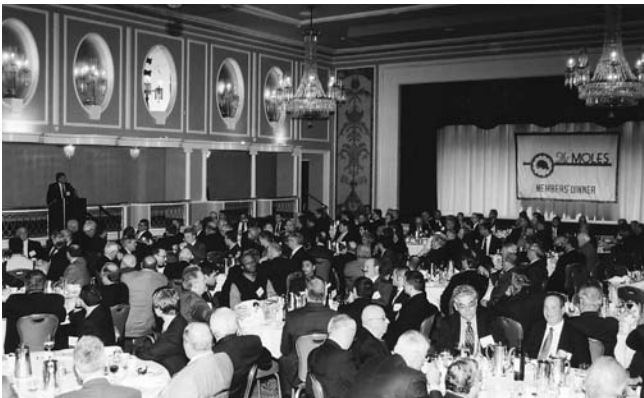
The Moles By-Laws: That meetings and other gatherings be held to exchange construction information and promote good fellowship