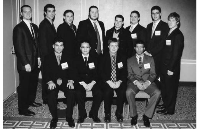
Student Award Recipients

Following the practice of recent years, recipients of The Moles Student Awards and Moles Scholarships, along with faculty members, were invited to a special reception hosted by The Moles Education Committee and all stayed on for the ensuing Lecture, Reception and Dinner.